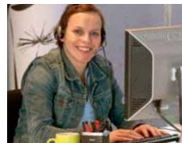
The care centre checks whether everything is all right with the resident