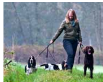
One of the services VieDome has enabled: the dog walking service