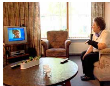
Calling the care centre on your own TV with the use of video communication

Examples of services that have proven to be very successful are the good morning service, welfare button and the digital diabetes card. In addition, various other services are offered in the areas of communication, service and comfort, information and advice and safety. At this moment, ZuidZorg has the largest number of connected clients and is involved in many innovative projects in the area of long-distance care in home care.