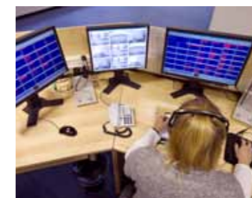
The care centre monitors the situation