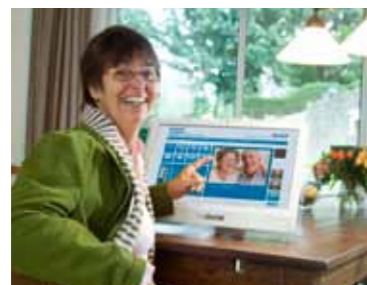
Just make a quick video communication with friends in Australia

Providing service and information through VieDome is very efficient and handy, for your organisation as well as for your tenants. VieDome is also suitable for the optimisation of your houses by integrating fire and burglary alarms, video intercom and a front door which can be opened using a remote control. You can also set up a virtual housekeeper service with VieDome. As almost all communication within VieDome is wireless, it requires little construction work in existing buildings. Naturally, VieDome is extremely suitable for application in new projects.