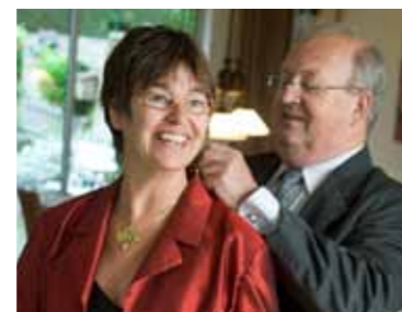
The couple has time left over for fun activities such as visiting a theatre or museum