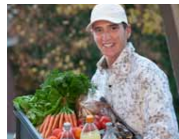
One of the services VieDome has enabled: the shopping service