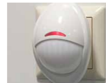
Motion sensors, which mainly monitor clients at night

VieDome ensures care is always at hand, whether the clients are located in an institution or at home in houses across a wide area. Moreover, VieDome helps to organise care efficiently, enabling effective care with a limited number of carers to more persons requesting care. The combination of technology and care services at VieDome aims to provide clients with a life that is as normal as possible, while having care always close at hand.